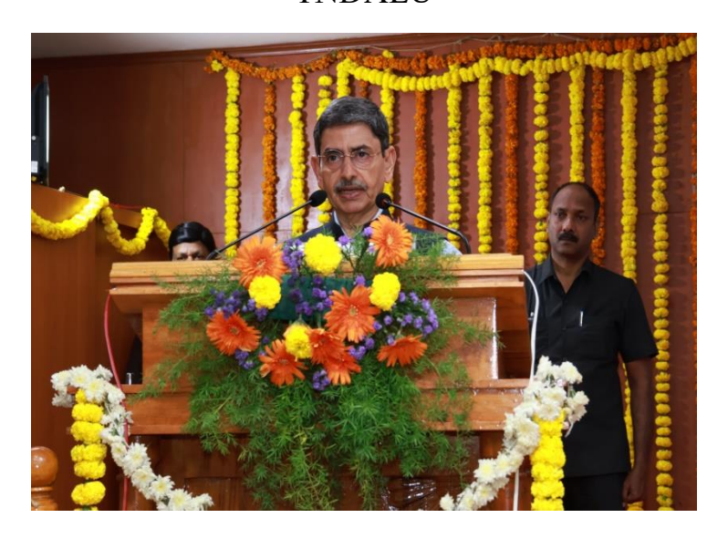
Penal discussion headed by Hon'ble Justice G. M. Akbar Ali on the topic "Landmark Judgement of Supreme Court and Amendments- How it shaped the Indian Constitution over time"