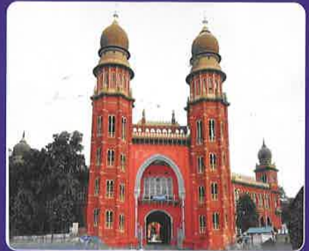
Dr. Ambedkar Govt. Law College, Chennai