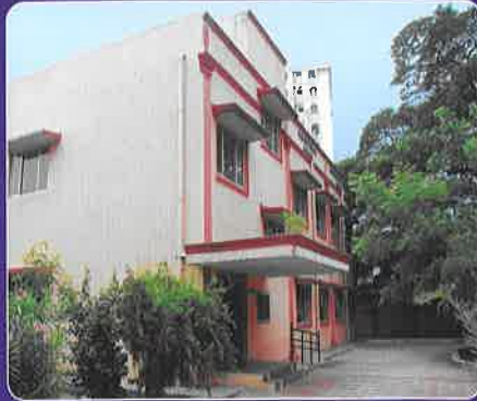
Directorate of Legal Studies, Chennai