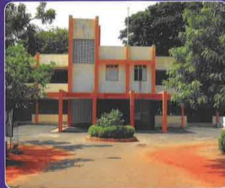
Govt. Law College, Madurai