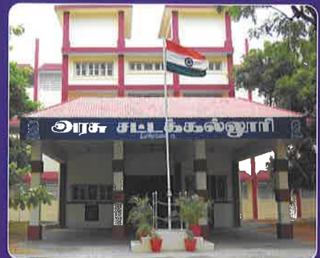
Govt. Law College, Trichy